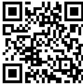
QR Code for online application

Remark Interested applicants can apply online from 3 – 20 October 2023. Please submit application form and documents as detailed in the announcement by scanning the QR Code.